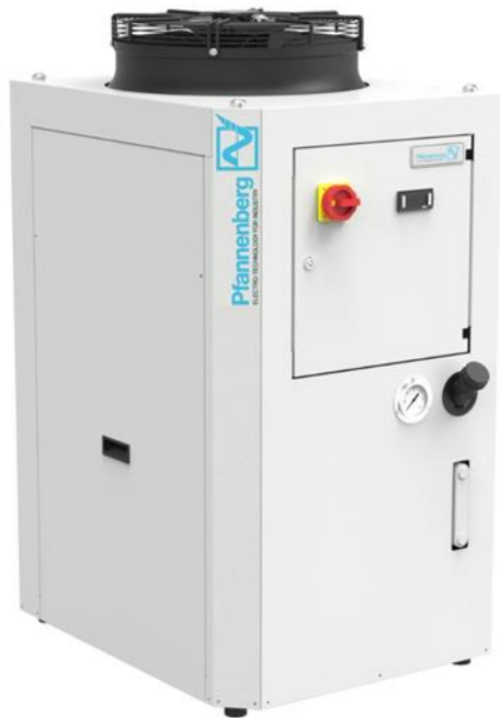
Fig. 1: Chiller from the EB-series

Large cooling units (chillers) for the cooling of machines are selected by the suppliers of machines and must be approved by the responsible planners.