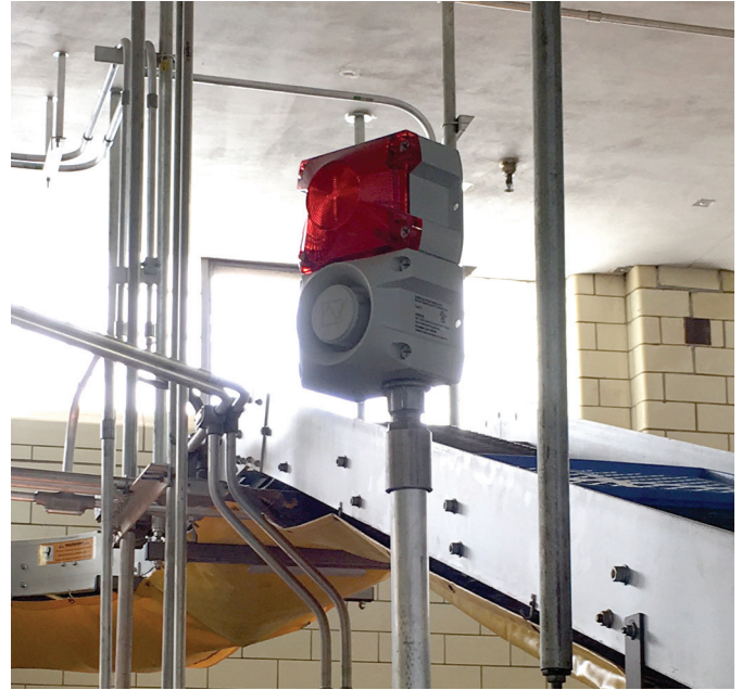
Pfannenberger The PA X 1-05 Flashing Light Sounder in the inspection line

The company's product, equipment, and employees are integral to Schwebel's operation. Schwebel's has spent many years building their strong reputation in the marketplace and with their customers; this is a top priority. They believe that investing in the best equipment will benefit their employees and bottom line of the organization. The Schwebel Baking Company relies on signaling devices from the PATROL series to support their manufacturing applications.