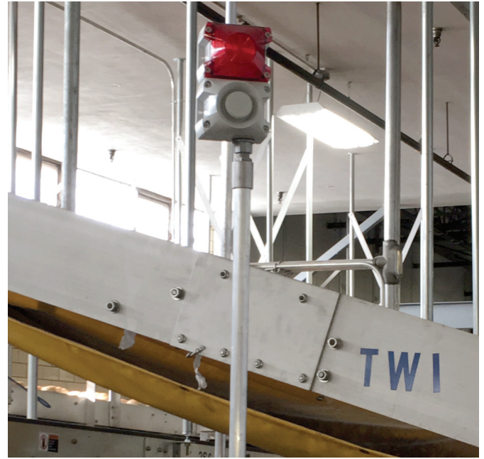
Pfannenberger PA X 1-05 100 dB Flashing Light Sounder attached to inspection machine

The Pfannenberger PA X 1-05 Flashing Light Sounder is attached to Schwebel's detecting machine. The alarm sounds and a light flashes anytime there's a defective loaf manufactured. Once it alerts, the detecting machine removes the rejected bread into a waste receiving area. Schwebel's implemented the Flashing Light Sounder and installed a time delay which would shut off the horn after a few seconds, but the light would continue flashing until an operator acknowledged it.